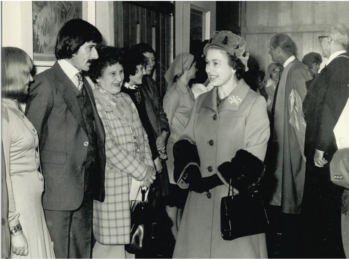
Above is a photo taken on 9 November 1977 of the Her Majesty the Queen, officially opening Wolfson as a College.