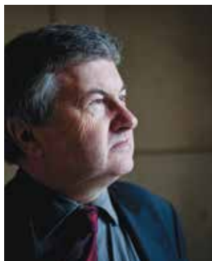
PROFESSOR SIR RICHARD EVANS

Like many other heads of Cambridge Colleges I am, among other things, a working academic, teaching and lecturing (in my case) in the History Faculty, researching and writing books, articles and reviews. This is also my fourth (and final) year as Gresham Professor of Rhetoric, which involves giving six public lectures a year on History for Gresham College, an old-established City institution, in London.