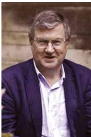
PROFESSOR SIR RICHARD EVANS

2015 marked the 50th Anniversary of Wolfson College's foundation as University College. Members returning for the first time in many years for the half-century celebrations in early July 2015 will have noticed the many changes that have taken place since their day, including new buildings and facilities and spectacularly improved garden displays. One thing that has not changed, however, is the College's open, friendly and all-inclusive atmosphere. Our current students come from some 80 different countries and our alumni are scattered across 120 different nations over the globe. As Cambridge's most cosmopolitan College, Wolfson takes special pleasure in welcoming back former students from almost every country in the world, from Albania to Zimbabwe, and our famously friendly porters and staff do everything they can to ensure that new students settle in quickly to life in Cambridge, which can be a rather strange and exotic experience for those who have never been to an ancient university before.